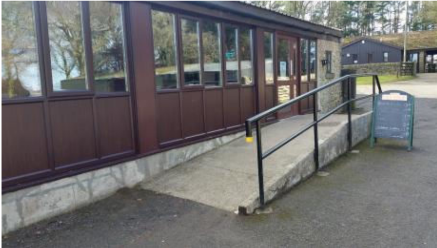
Tea Room Ramp