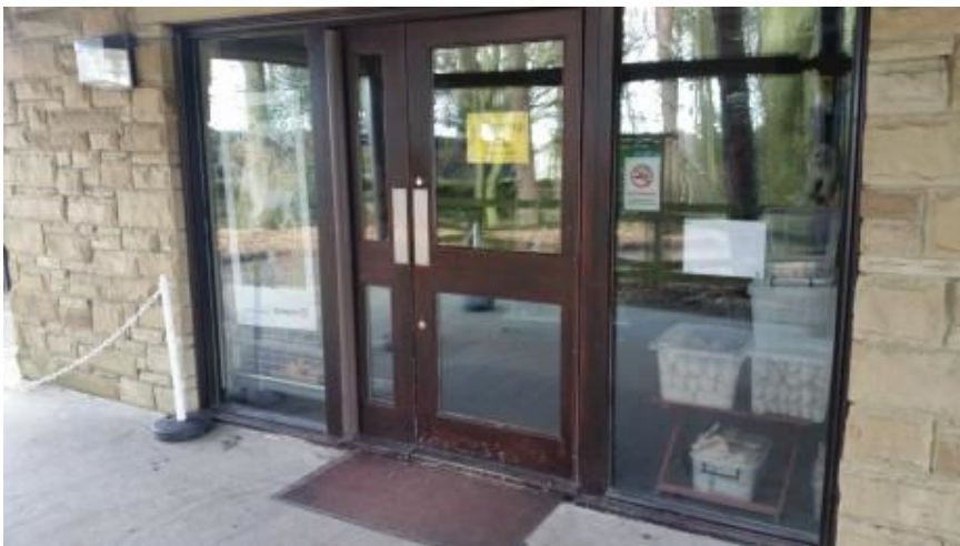
Entrance / Giftshop - Entrance & Exit