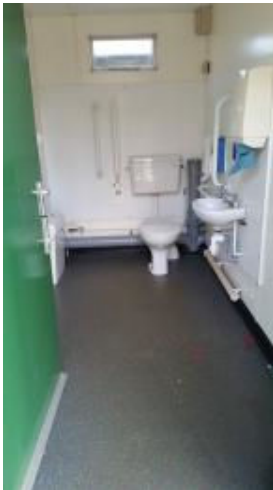
Disabled Toilet - Internal