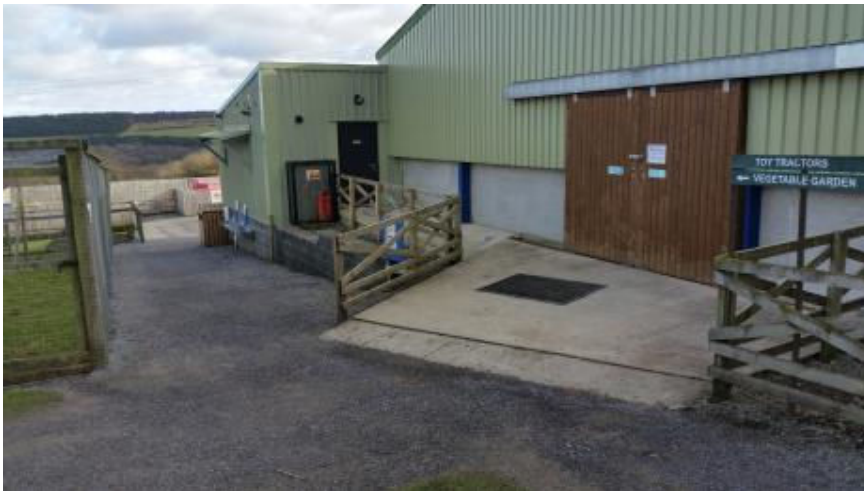
Entrance to Playbarn

No tables are permanently fixed No chairs are permanently fixed The standard height for tables is 750mm Menus are wall only Menus are clearly written The type of food served here is snacks. There are sinks to the left as you enter the Soft Play Barn The height of the sinks are 690mm 10 x Highchairs 39 x Tables 156 x Chairs (Min) Door to the toilet area is (W)800mm