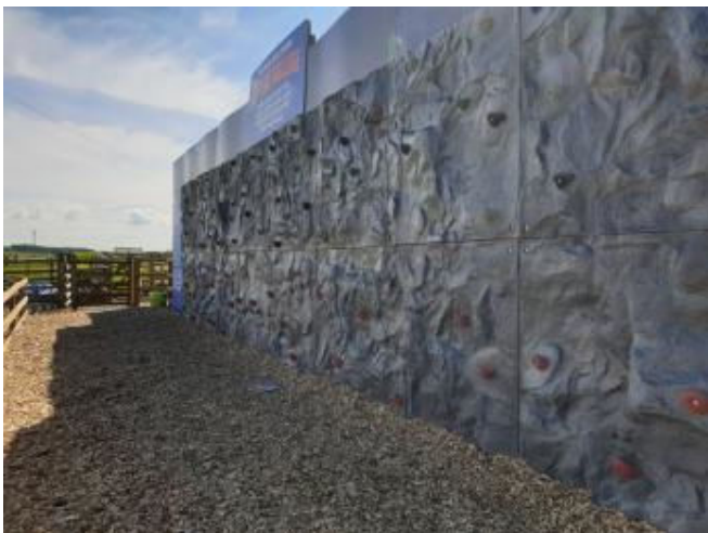
Climbing Wall area