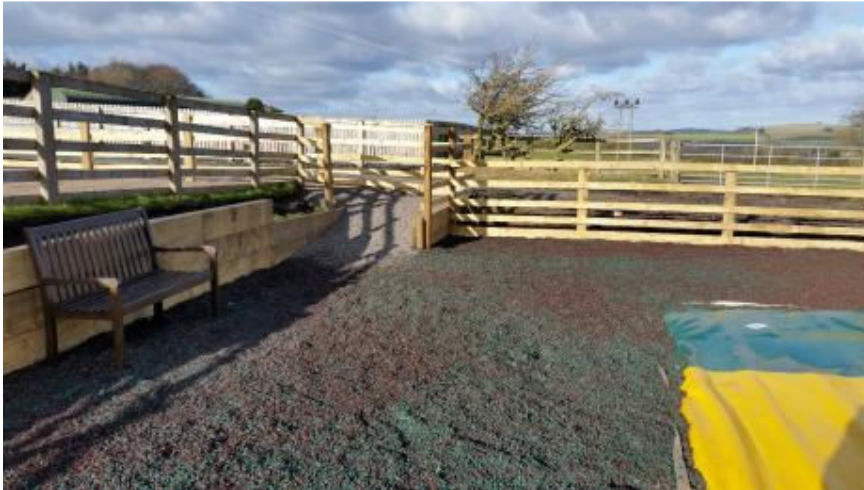
Pillow 2 Entrance