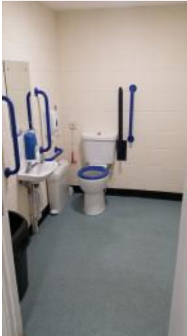
Disabled Toilet - Inside