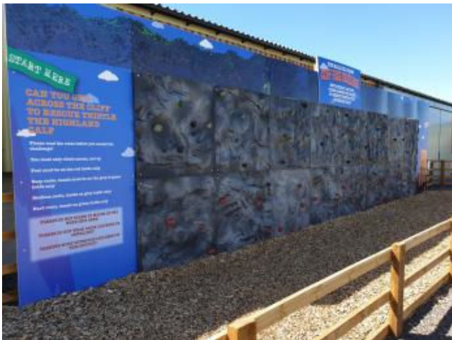
Climbing Wall Start