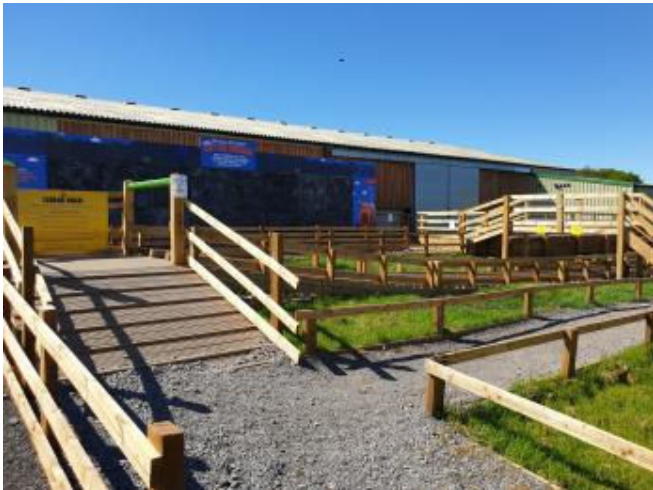
Entrance / Starting Ramp