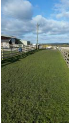
Grass around Animal Paddocks