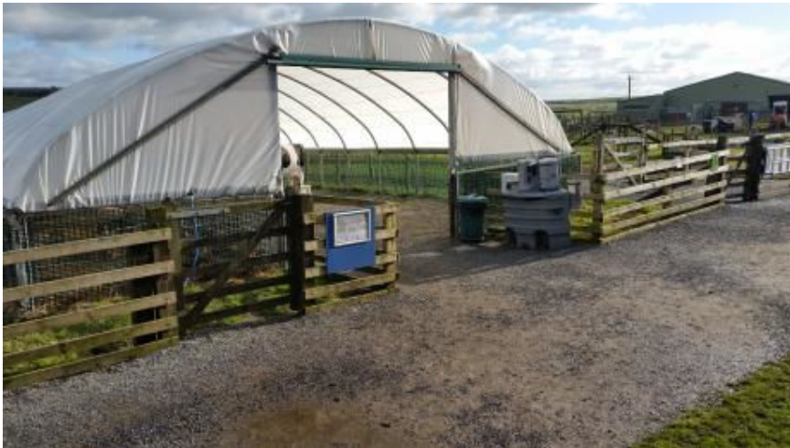
Entrance to Polytunnel 2