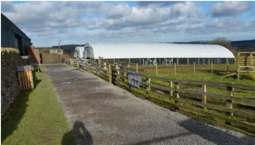
Gravel Path to the Playarea