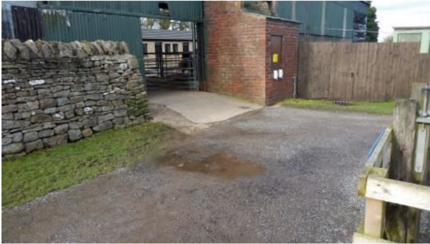
Gravel Path to the Donkeys