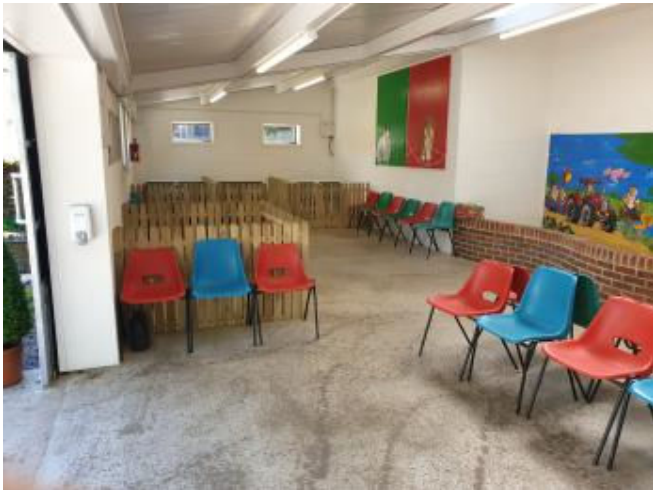
Inside Rabbit Barn