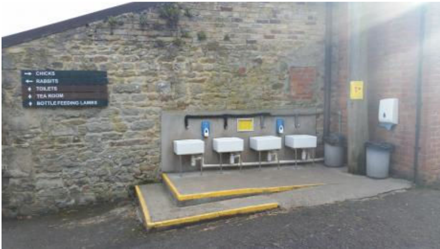
Chick Hand Washing