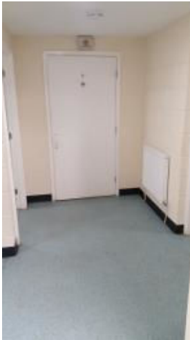
Disabled Toilet - External