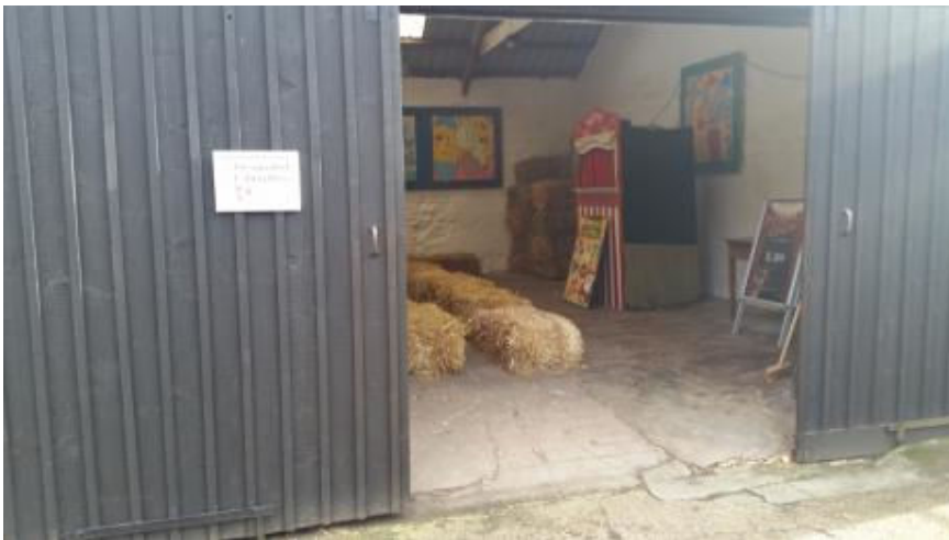
Entrance to Puppet Show Barn