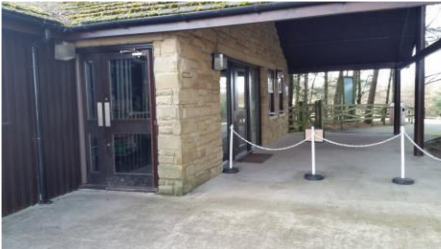
Entrance / Exit Door