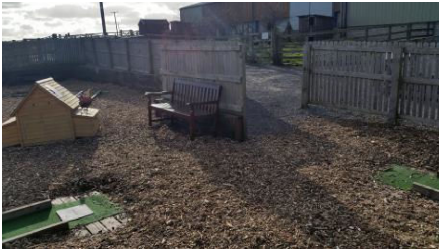
Crazy Golf Flooring detail