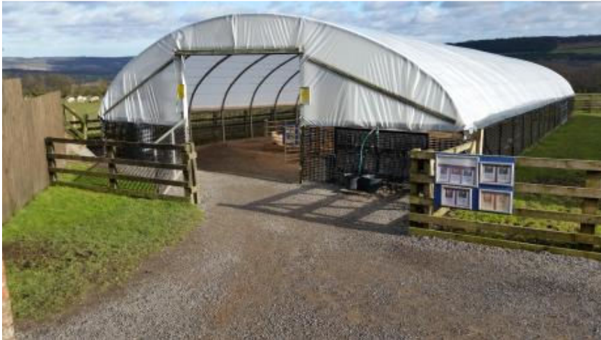
Entrance to Polytunnel 1