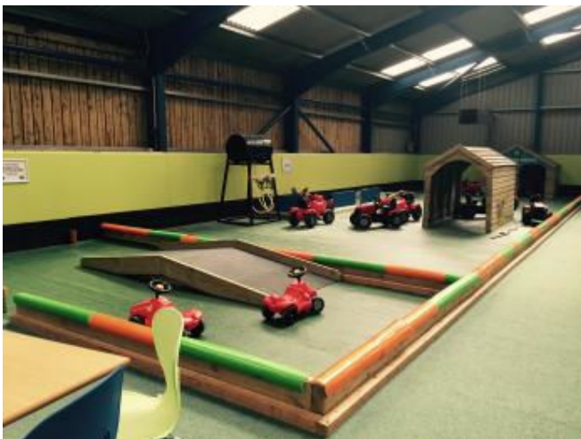
Toy Tractor Track