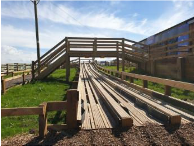
Climbing wall exit bridge