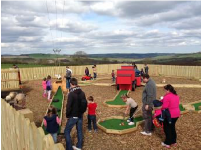
Crazy Golf Course