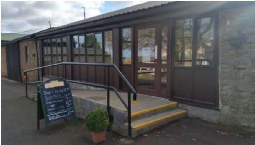
Tea Room Steps

We are able to cater for special dietary requirements, please ensure staff are aware of this prior to ordering your food.