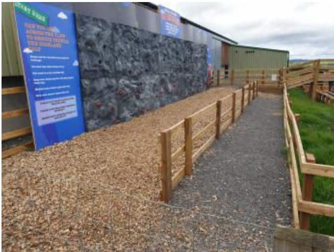
Entrance / 2nd Exit