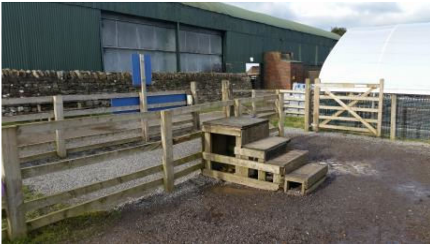
Donkey Ride Mounting Block