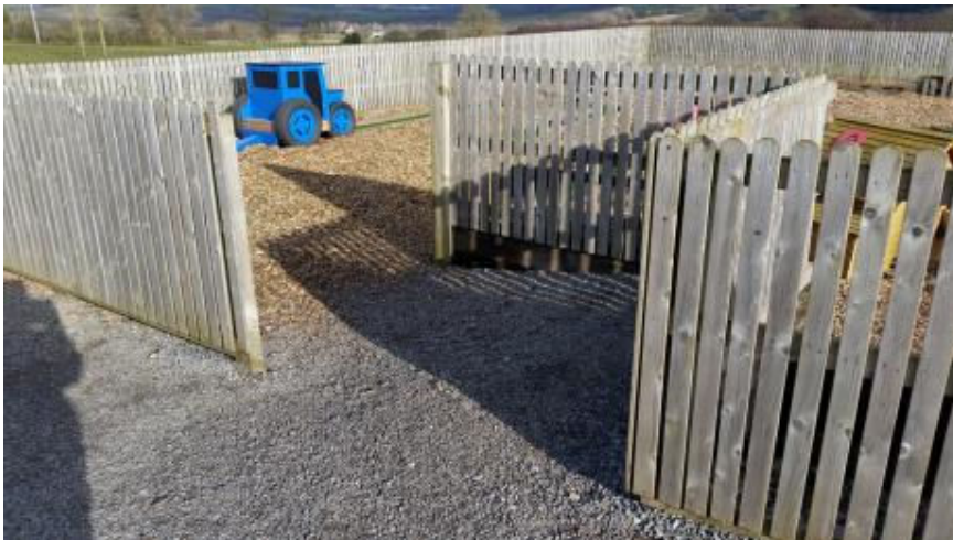
Gravel Entrance ramp to bark chip