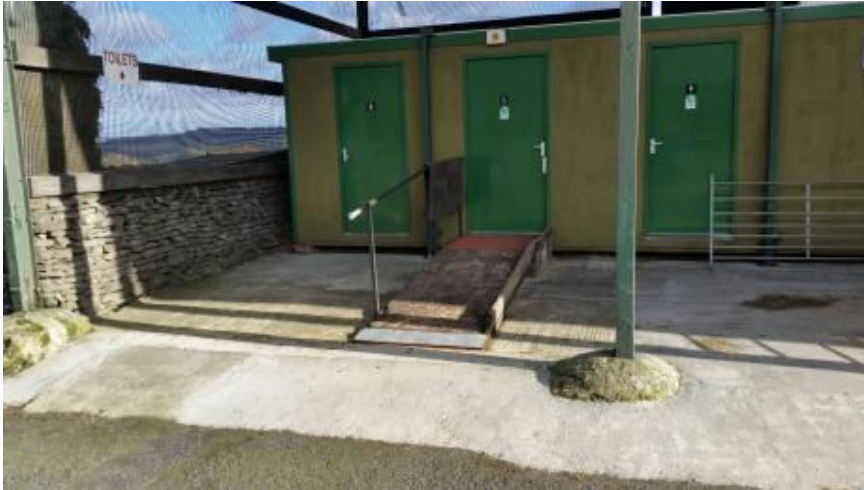
Disable Toilet with Ramp