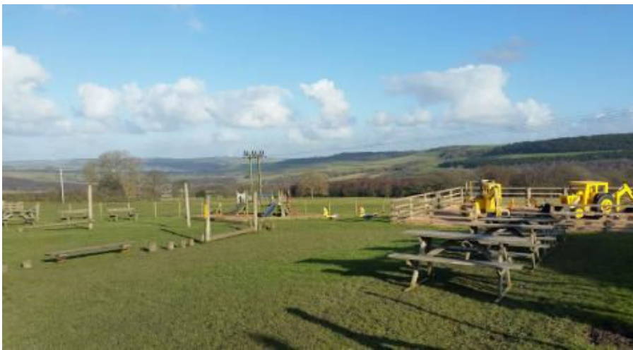
Outdoor Picnic Area