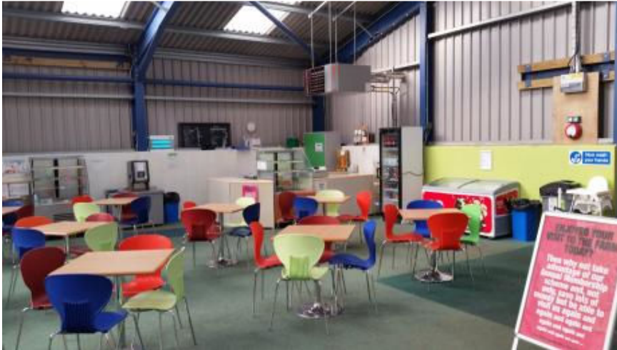
Internal View 2