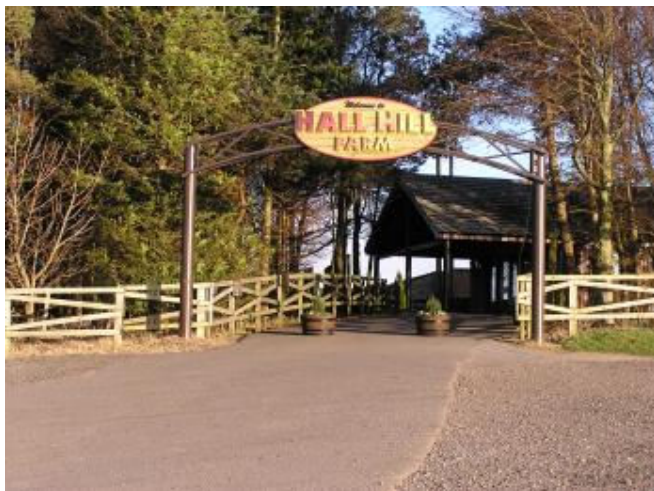
Entrance from Carpark