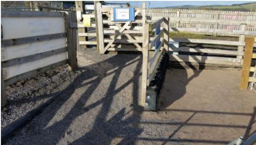
Pillow 1 & 2 Entrance