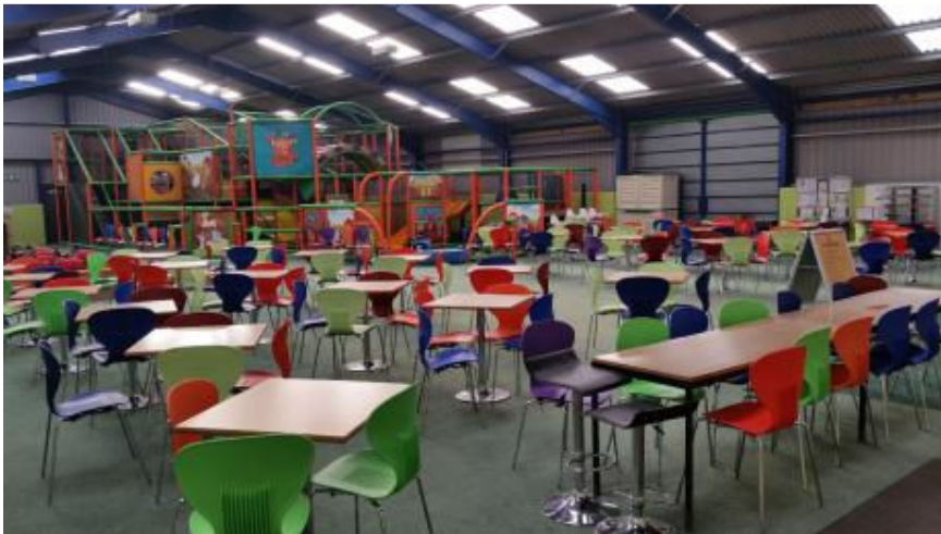
Internal View 1