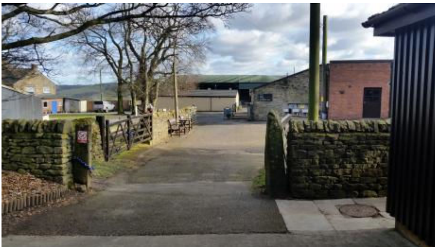
Entrance into Farmyard