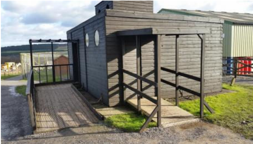
Entrance & Exit to the Ark