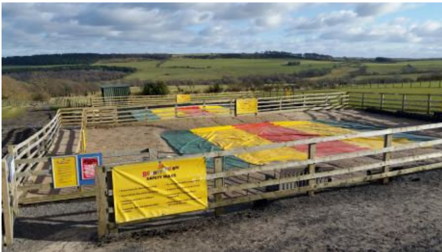
Bouncy Pillows Overview