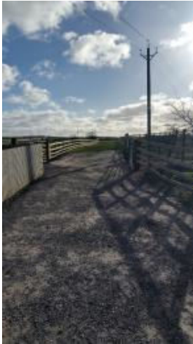
Gravel Path to the Animal Paddocks