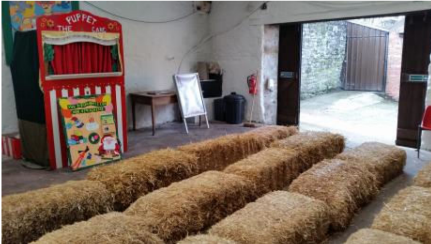
Inside the Puppet Show Barn