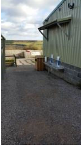
Gravel Path to The Paddocks/Crazy Golf & Bouncy Pillows