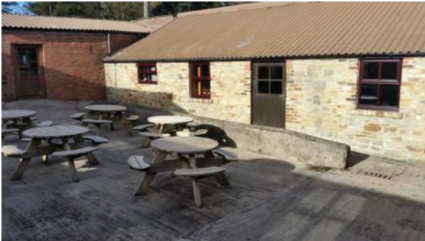
Tea Room Courtyard 1