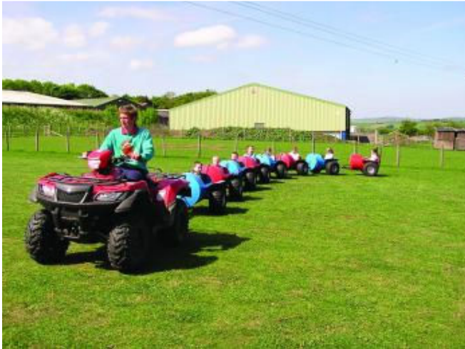
Barrel Train Ride