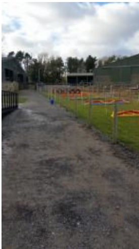
Gravel Path to the Sheep Race/Tractor Ride & The Ark