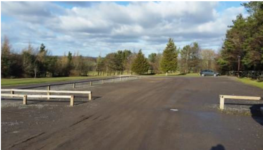
Car Parking 1