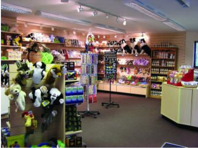
Gift Shop - Internal