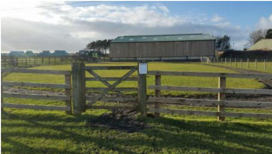
Barrel Train Entrance/Exit