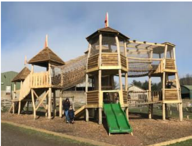
New Play Equipment April 2018