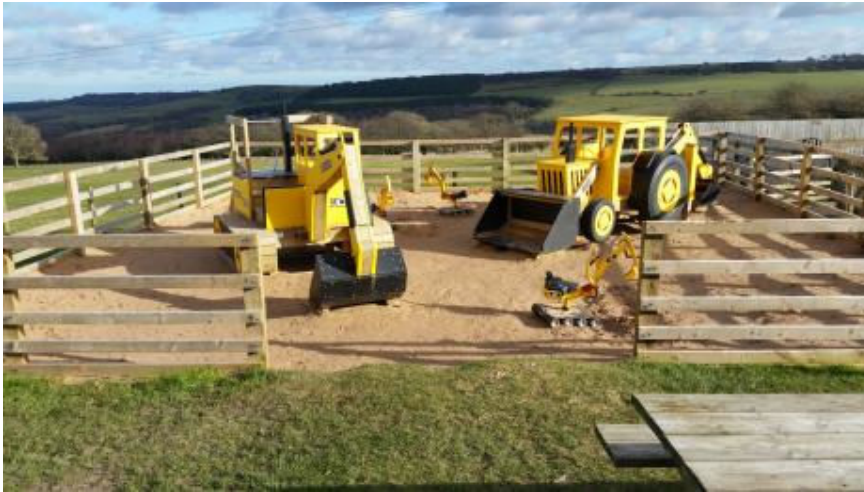
Entrance to Sandpit