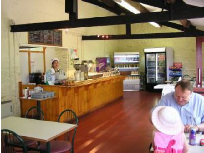
Tea Room - Internal