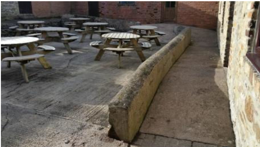
Tea Room Courtyard 2