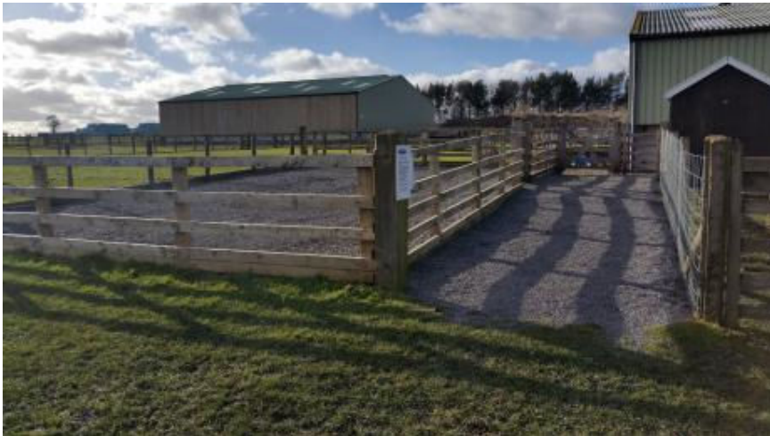
Entrance to water wars