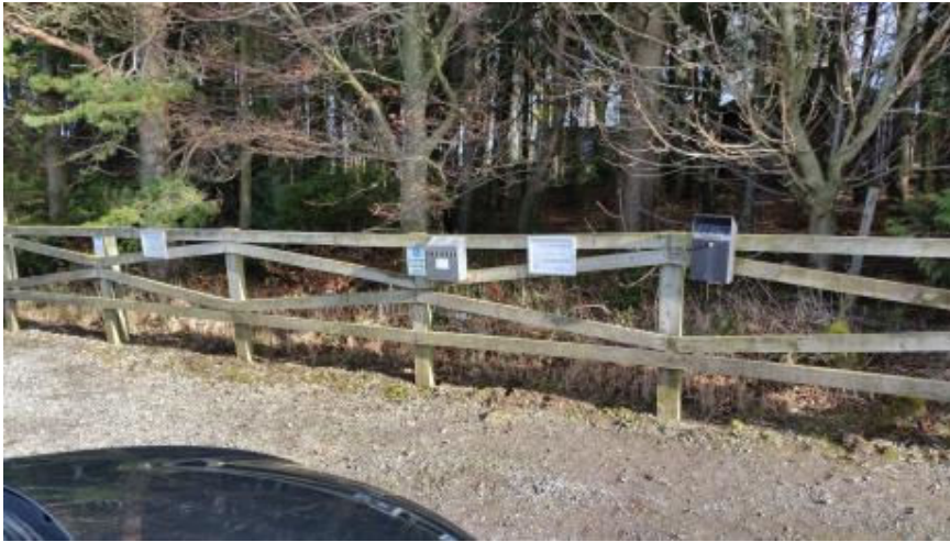
Smoking Area - Car Park