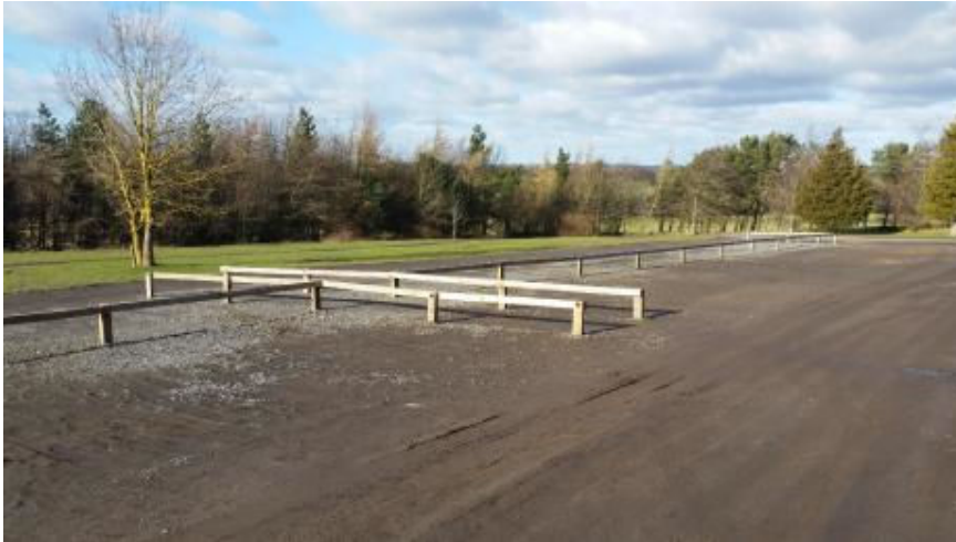
Car Parking 2